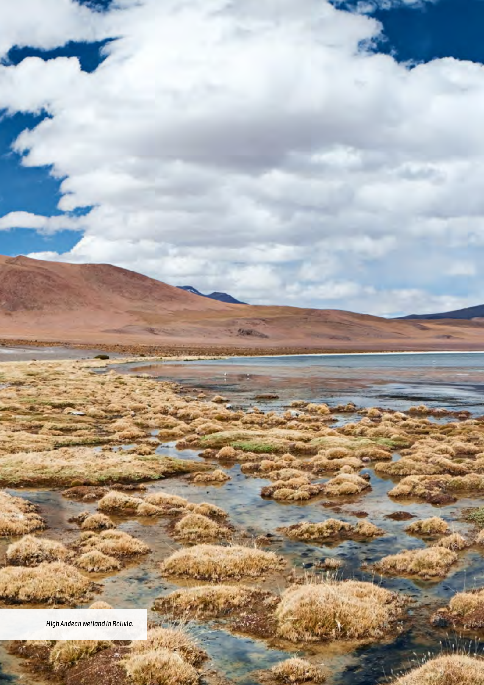
High Andean wetland in Bolivia.