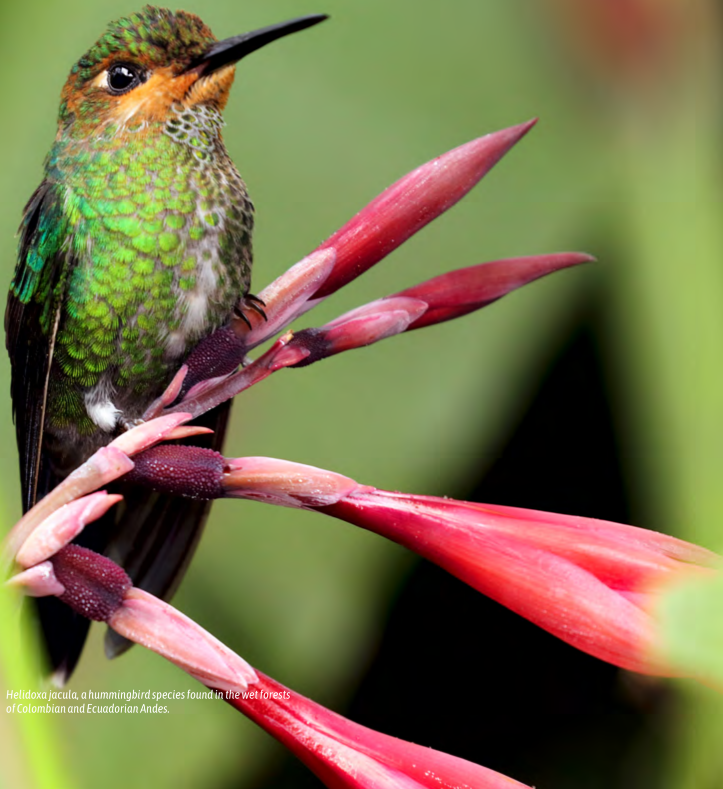
Helidoxa jacula , a hummingbird species found in the wet forests of Colombian and Ecuadorian Andes.