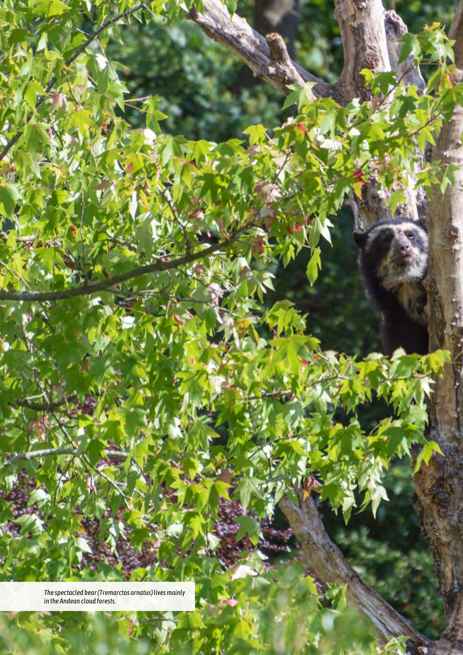
The spectacled bear ( Tremarctos ornatus ) lives mainly in the Andean cloud forests.