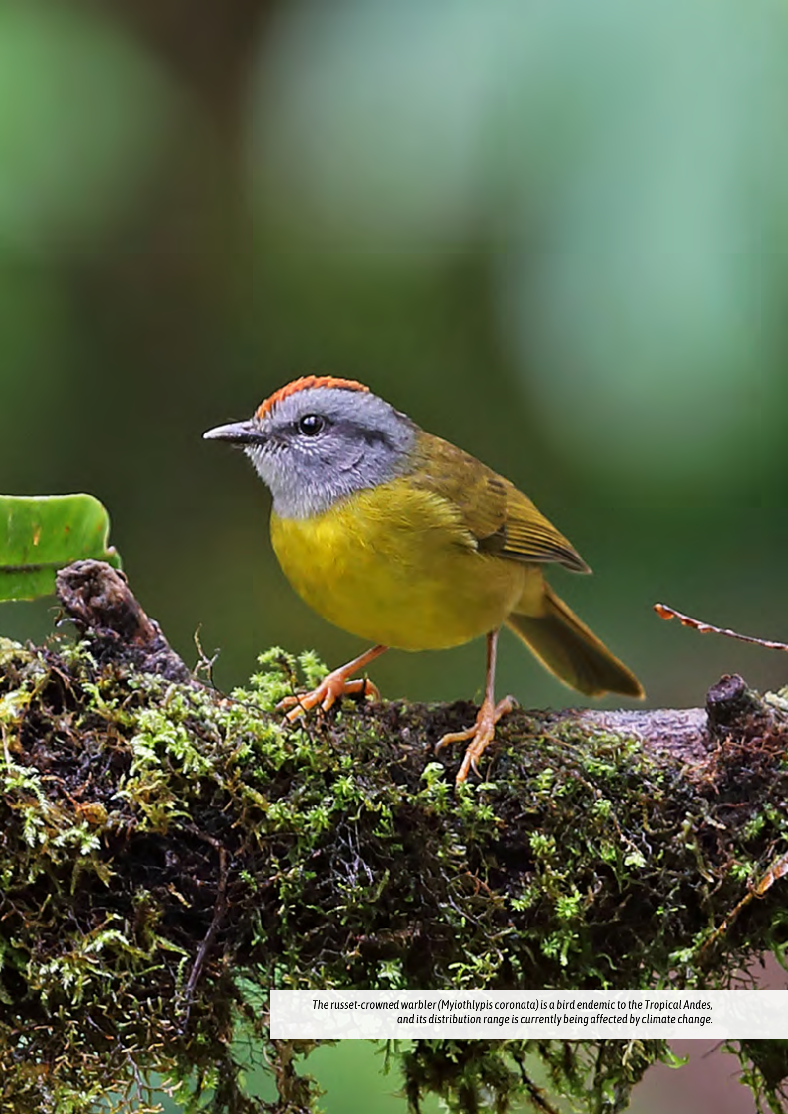
The russet-crowned warbler ( Myiothlypis coronata ) is a bird endemic to the Tropical Andes, and its distribution range is currently being affected by climate change.