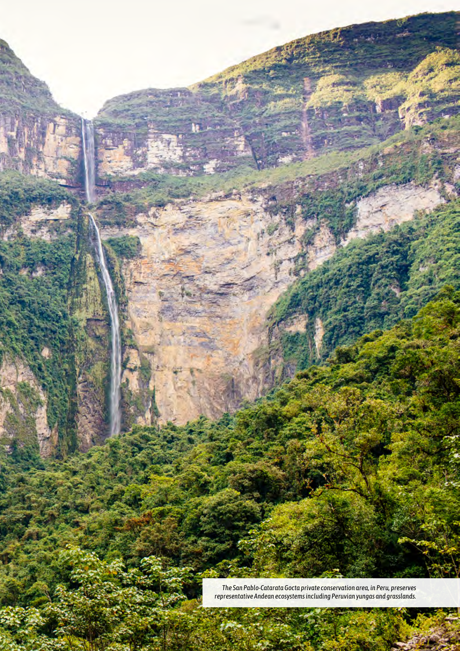
The San Pablo-Catarata Gocta private conservation area, in Peru, preserves representative Andean ecosystems including Peruvian yungas and grasslands.