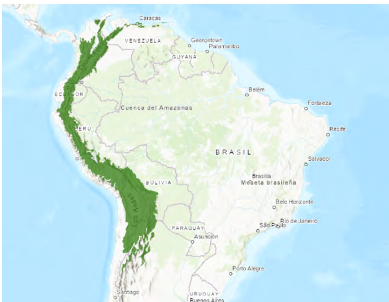
Map 1. The Tropical Andes biodiversity hotspot.

Biological diversity is therefore not only severely affected by climate change but also plays a key role in climate change mitigation and adaptation through the ecosystem services it supports. In short, biodiversity loss and ecosystem decline exacerbate climate change and its adverse impacts.