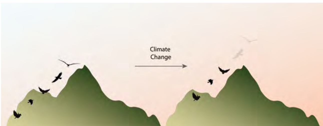
Figure 1. The effects of climate change on mountain species.

Local extinction risk is higher for mountaintop species. As temperature increases, many species' suitable habitat shifts upslope and gradually starts shrinking. When cool-adapted summit species cannot shift further, as they have nowhere left to go, mountaintop extinctions can occur.