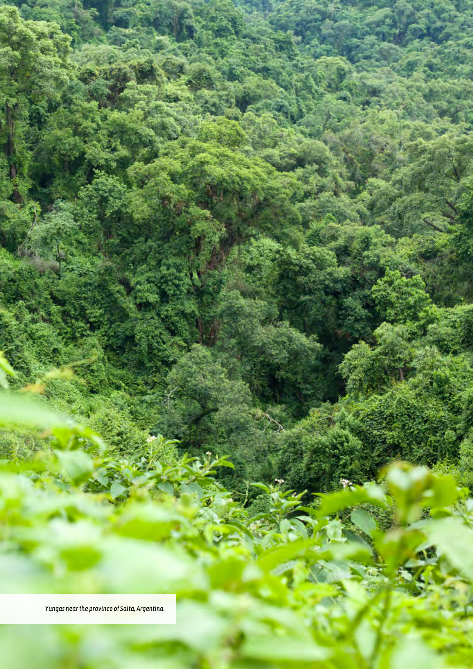
Yungas near the province of Salta, Argentina.