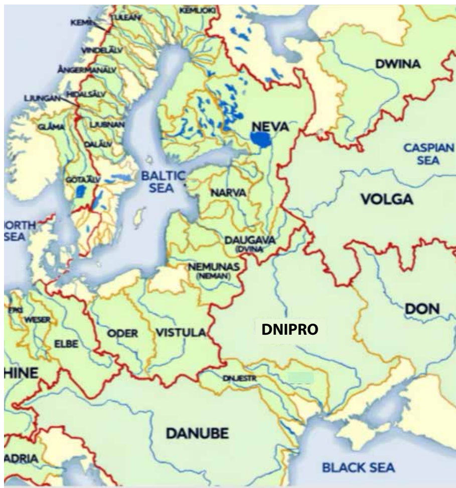
Fig. 1. The area between the Baltic and Black Seas

The region encompasses EU countries such as Poland, Lithuania, Latvia, Estonia, Sweden, Denmark, Finland, Romania, and Bulgaria, as well as Ukraine, a candidate country on its path toward EU membership. This intermarium area – Baltic–Black Sea region – includes major river basins such as the Vistula, Oder, Danube, and Dniro rivers, together with numerous smaller river catchments. Collectively, these river systems, contribute to environmental pressures through the transport of CO 2 , nutrients, and other pollutants. Key economic activities relevant for waters in the region includes fisheries and aquaculture, maritime transport (TEN-T corridors 2 ), coastal tourism, and building energy security (offshore, LNG). Below is a map illustrating the intermarium area (Fig. 1).